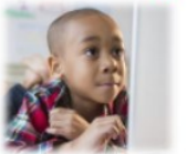
Who is he e-mailing??