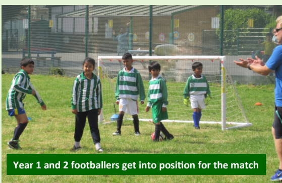
Year 1 and 2 footballers get into position for the match

The Year 1 and 2 football club went for a match to St. Joseph's. Despite tough opposition, our children showed courage and determination throughout the match, making us proud to call them Elsley footballers!