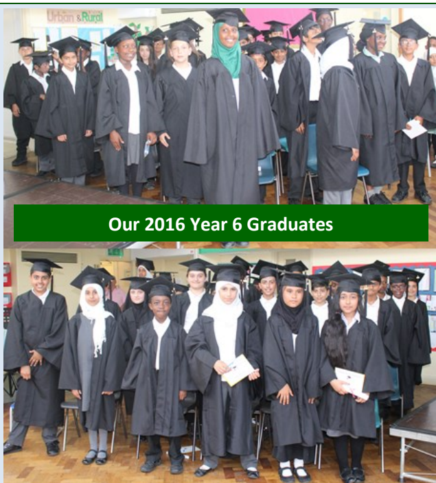
Our 2016 Year 6 Graduates