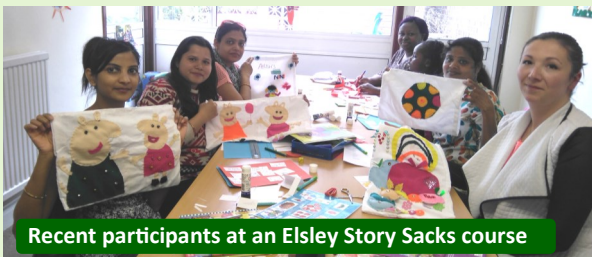
Recent participants at an Elsley Story Sacks course

Why would you want to make one? It's a great way to get a child interested in reading than by getting them involved with the story. By using puppets or playing a game, wearing a costume, and other ideas, the children are more excited by the story.